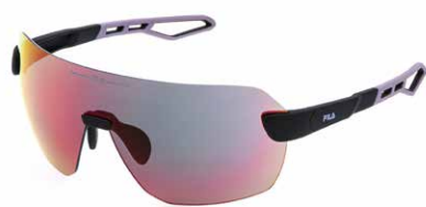
U28V: MULTILAYER MIRROR, ANTISCRATCH, WATER REPELLENT LENS. All purpose