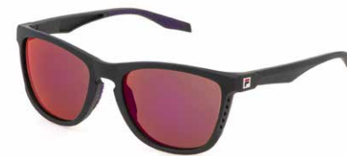
AAUX: RED MULTILAYER MIRROR, ANTISCRATCH, WATER REPELLENT LENSES. Road sports