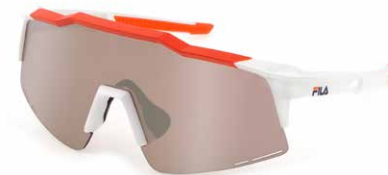
6VCX: SILVER MIRROR, ANTISCRATCH, WATER REPELLENT LENS.