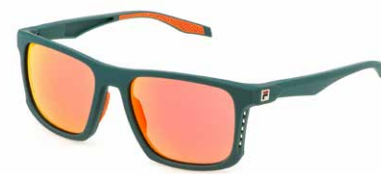
B63X: ORANGE MULTILAYER MIRROR, ANTISCRATCH, WATER REPELLENT LENSES. Green sports