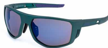
U24V: PURPLE MULTILAYER MIRROR, ANTISCRATCH, WATER REPELLENT LENSES. Green sports