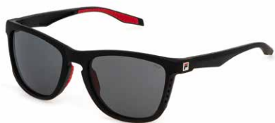
0U28: SMOKE, ANTISCRATCH, WATER REPELLENT LENSES. All purpose