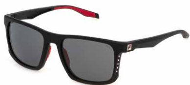
0U28: SMOKE, ANTISCRATCH, WATER REPELLENT LENSES. All purpose