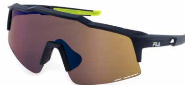
U43B: BLUE MIRROR, ANTISCRATCH, WATER REPELLENT LENS.