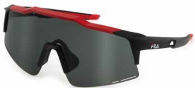
0965: SMOKE, ANTISCRATCH, WATER REPELLENT LENS.