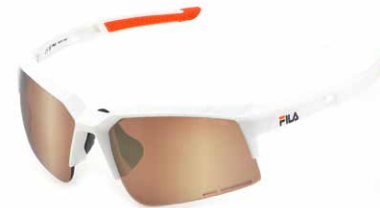
5WWX: SILVER MIRROR, ANTISCRATCH, WATER REPELLENT LENSES. Snow sports