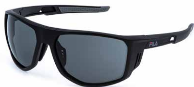
0U28: SMOKE, ANTISCRATCH, WATER REPELLENT LENSES. All purpose