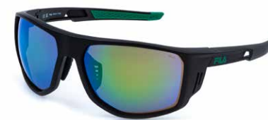
U28V: GREEN MULTILAYER MIRROR, ANTISCRATCH, WATER REPELLENT LENSES. Road sports