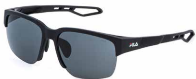
0U28: SMOKE, ANTISCRATCH, WATER REPELLENT LENSES. All purpose