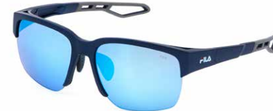
7U4B: BLUE MULTILAYER MIRROR, ANTISCRATCH, WATER REPELLENT LENS. Green sports