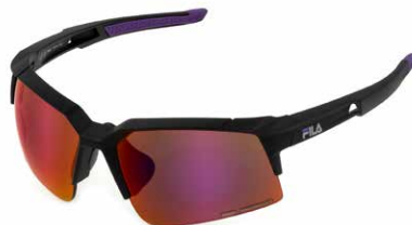
U28V: VIOLET MULTILAYER MIRROR, ANTISCRATCH, WATER REPELLENT LENSES. Road sports