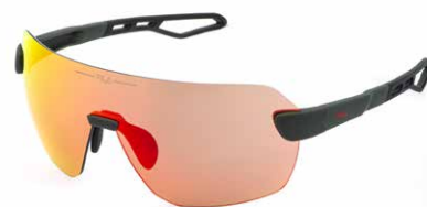
J97R: ORANGE MULTILAYER MIRROR, ANTISCRATCH, WATER REPELLENT LENS. Water sports