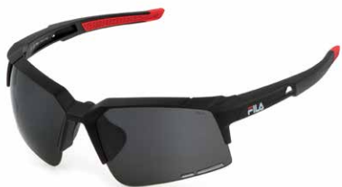
U28G: SMOKE, POLARIZED, ANTISCRATCH, WATER REPELLENT LENSES. All purpose