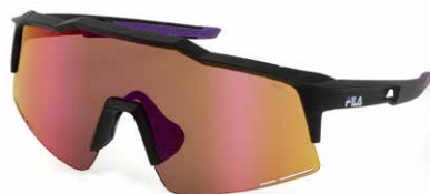
U28V: BROWN MIRROR, ANTISCRATCH, WATER REPELLENT LENS.