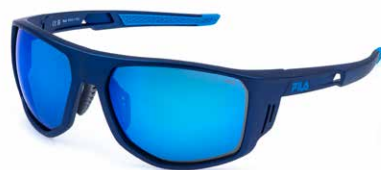
7U4B: BLUE MULTILAYER MIRROR, ANTISCRATCH, WATER REPELLENT LENSES. All purpose