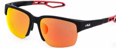
U28R: ORANGE MULTILAYER MIRROR, ANTISCRATCH, WATER REPELLENT LENS. Water sports