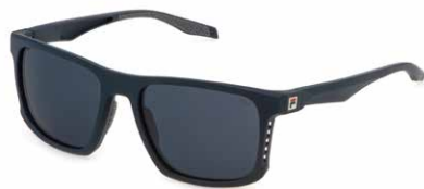
06QS: BLUE, ANTISCRATCH, WATER REPELLENT LENSES. All purpose