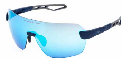
7U4B: BLUE MULTILAYER MIRROR, ANTISCRATCH, WATER REPELLENT LENS. Green sports