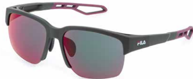
J97V: MULTILAYER MIRROR, ANTISCRATCH, WATER REPELLENT LENSES. All purpose