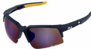
U43B: BLUE MIRROR, ANTISCRATCH, WATER REPELLENT LENSES. Water sports