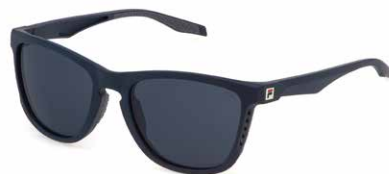
06QS: BLUE, ANTISCRATCH, WATER REPELLENT LENSES. All purpose