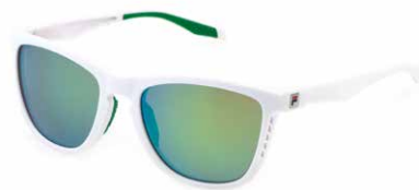
847V: KHAKI MULTILAYER MIRROR, ANTISCRATCH, WATER REPELLENT LENSES. Water sports