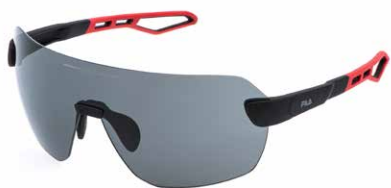
0U28: SMOKE, ANTISCRATCH, WATER REPELLENT LENS. All purpose